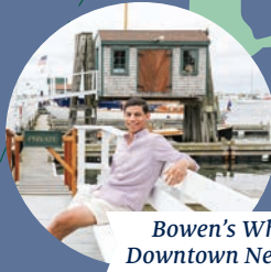
Bowen's Wharf Downtown Newport