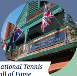
International Tennis Hall of Fame