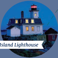
Rose Island Lighthouse