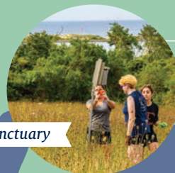
Norman Bird Sanctuary