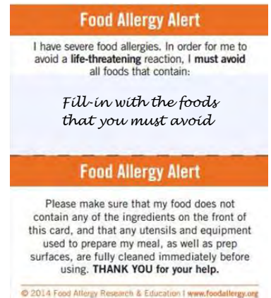
Example of a “Chef’s Card” that can presented to a restaurant staff.

See the FARE website ( https://www.foodallergy.org/managing-food-allergies/dining-out ) to download a food allergy alert “Chef Card” template in English, as well as in a number of foreign languages.