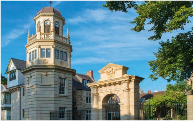
Image: Grounds at Harris Manchester College