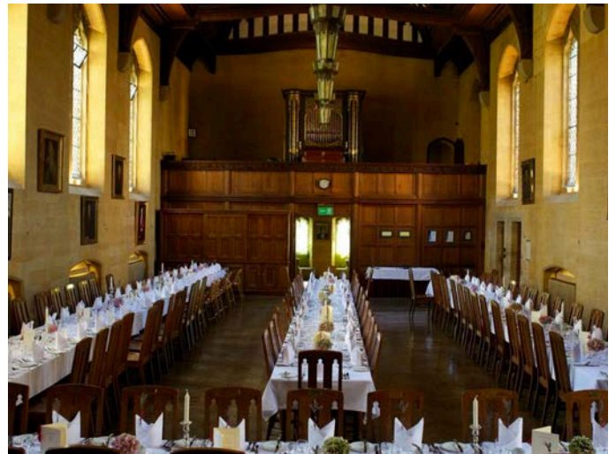
Image: Dining Hall at Harris Manchester College