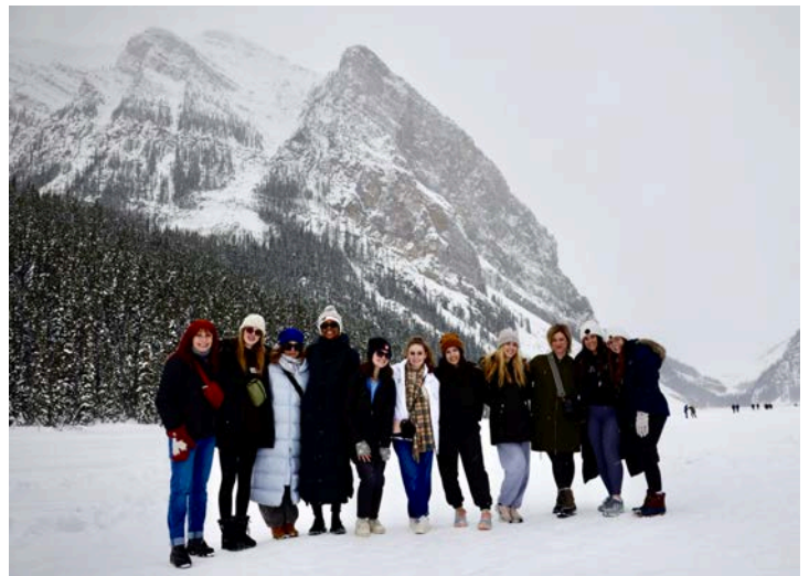
Image: Banff National Park Daytrip, Calgary 2024 program