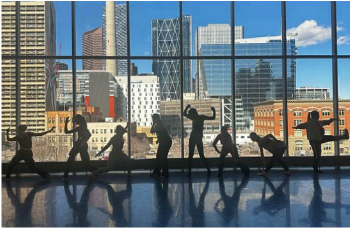
Image: Training session at Decidedly Jazz Danceworks featuring live music, Calgary 2024 program