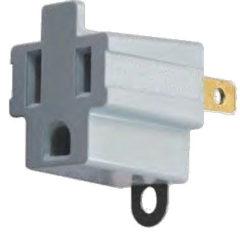
Remember: If your laptop has grounded plug, you require a grounded adaptor (3 prongs).