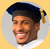
Jon Batiste '17 (Hon.) music director/ bandleader for "The Late Show with Stephen Colbert"