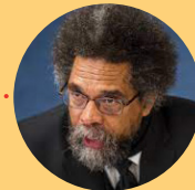
Dr. Cornel West former professor at Harvard and Princeton Universities