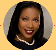
Isabel Wilkerson author and winner of the Pulitzer Prize and National Humanities Medal