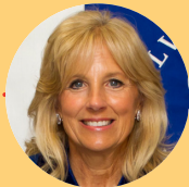
Dr. Jill Biden '11 (Hon.) educator and First Lady of the United States