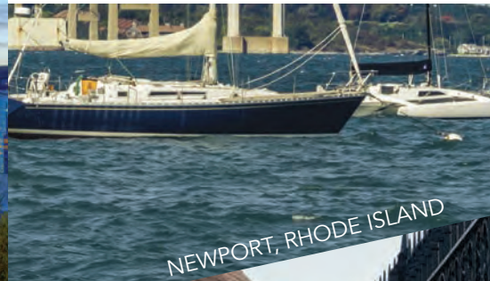
NEWPORT, RHODE ISLAND

Newport is a small city of 25,000 - famous as a sailing, surfing and tourist destination. Students can safely walk or bike to the nearby beaches or to the center of the harbor-side town to access shops, restaurants, cafes, banks, and social and cultural activities. Public transportation options provide easy access to the nearby cities of Providence and Boston. New York City is three-and-a-half hours away (237 km).