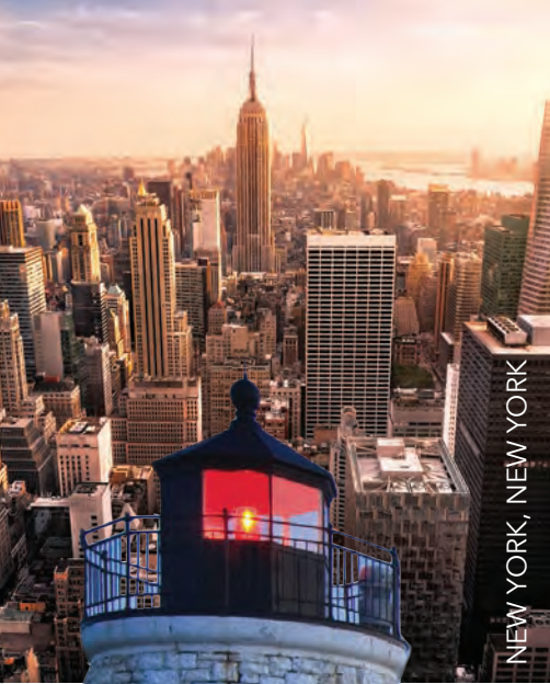
NEW YORK, NEW YORK