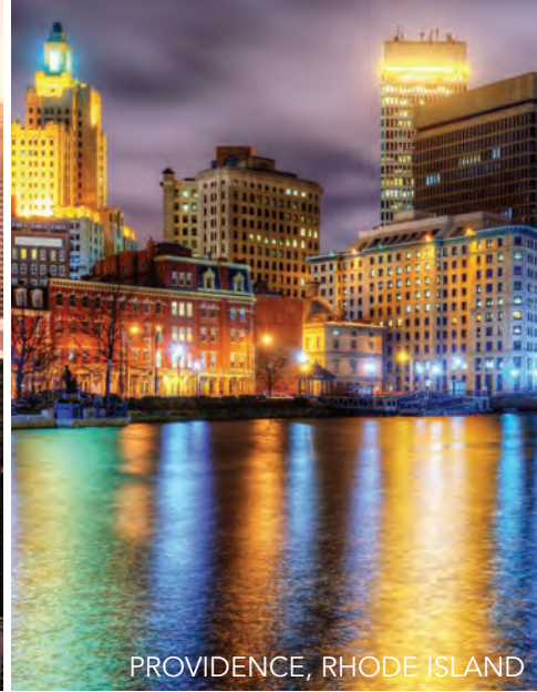
PROVIDENCE, RHODE ISLAND