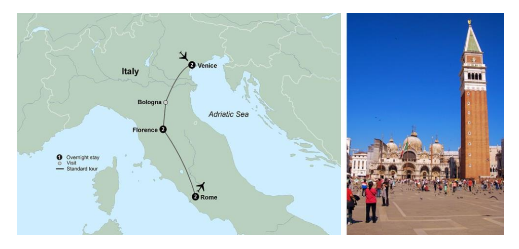
8 Days • 10 Meals: 6 Breakfasts, 1 Lunch, 3 Dinners